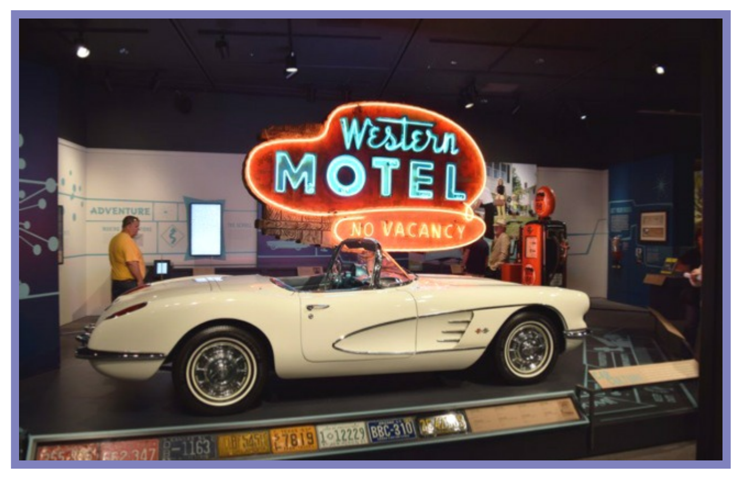
Part of the Route 66 display at The Autry National Center in Los Angeles.