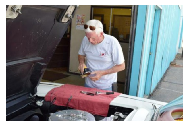
Now it was just a matter of trying to survive The heat during the rest of the trip home.

H&C Truck Electrical Service, Albuquerque, NM.